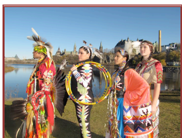
Aboriginal Experiences, Ottawa, Ontario

The Aboriginal Tourism Association of Canada (ATAC) includes over 20 Aboriginal tourism industry organizations and government representatives from every province and territory in Canada. Through a unified Aboriginal tourism industry voice, ATAC focuses on marketing, product development support, and creating partnerships between associations, organizations, government departments and industry leaders from across Canada to support the growth of Aboriginal tourism in Canada