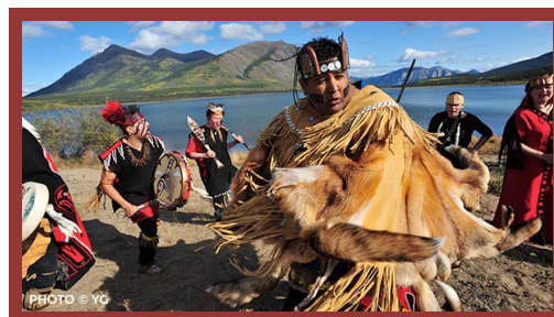
Yukon First Nation Tourism Association