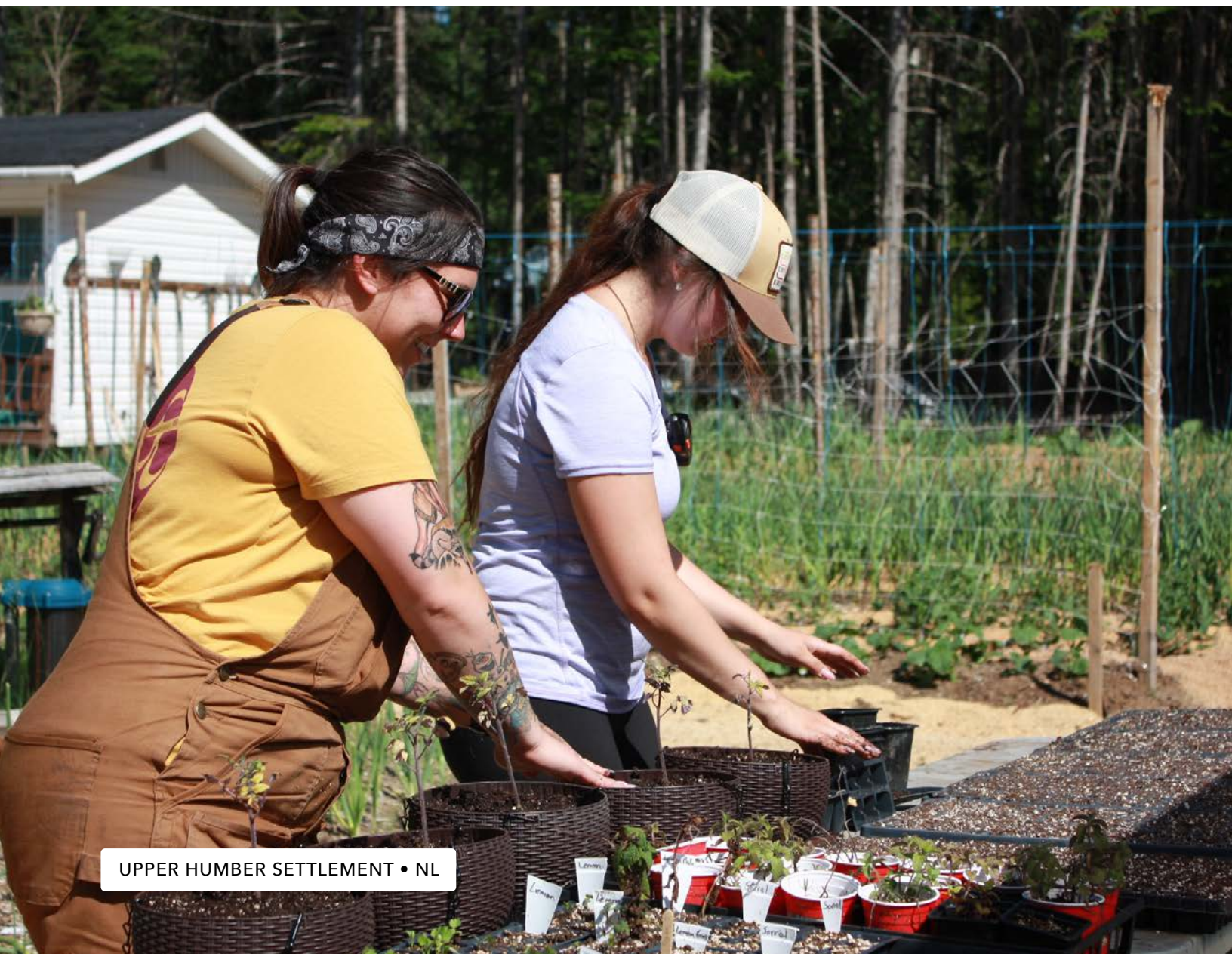
UPPER HUMBER SETTLEMENT • NL